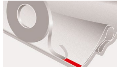
Fabric and textile mounting